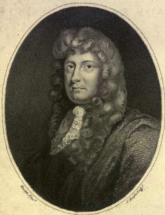
LORD WILLIAM RUSSELL.